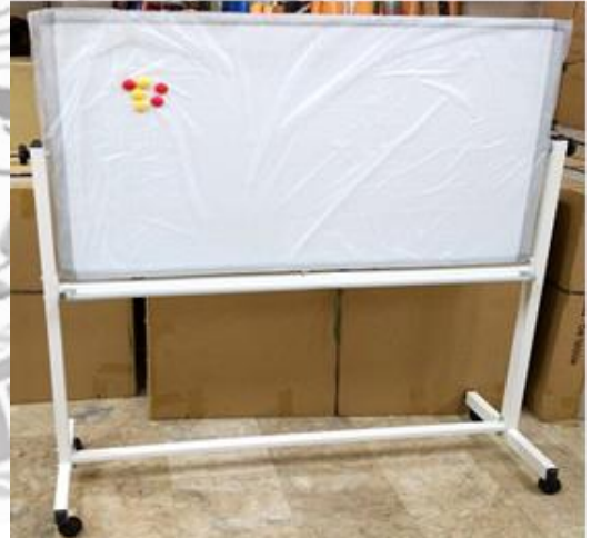
4. WHITEBOARD 2