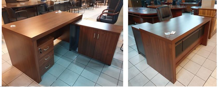
2. EXECUTIVE TABLE, L-TYPE