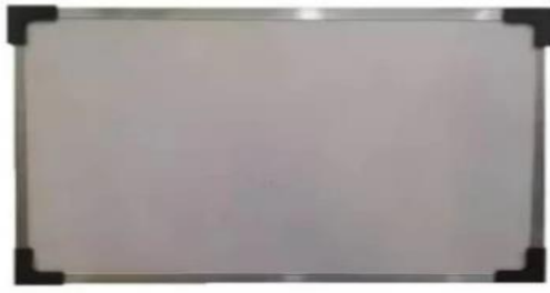
5. WALL MOUNTABLE WHITE BOARD