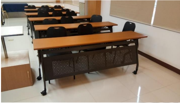
1. MULTI-PURPOSE TABLE