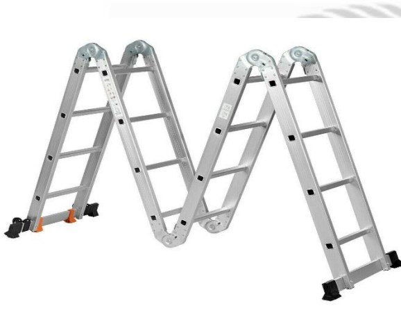
7. STEP LADDER (FOLDABLE)