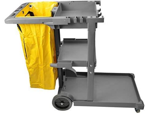
6. UTILITY CART with WHEELS