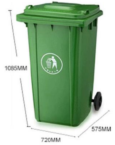
8. BIG TRASH BIN with WHEELS