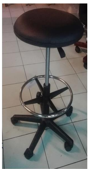
NOTE: USE CHROME LEGS