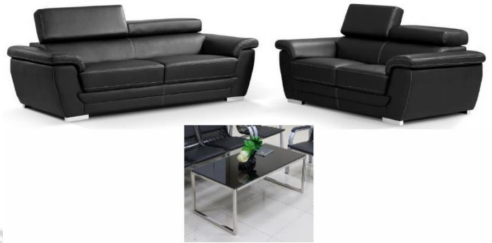
2. SOFA SET 1