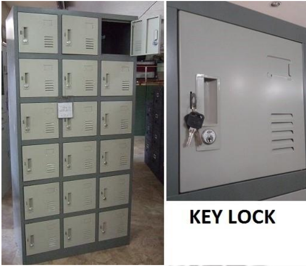
1. COMBO METAL LOCKER (Sample only)