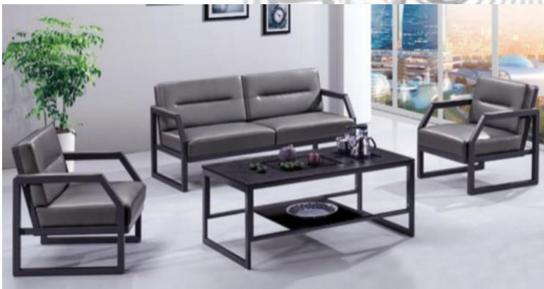
3. SOFA SET 2