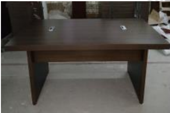
3. CONFERENCE TABLE 1