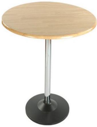
12. ROUND TABLE