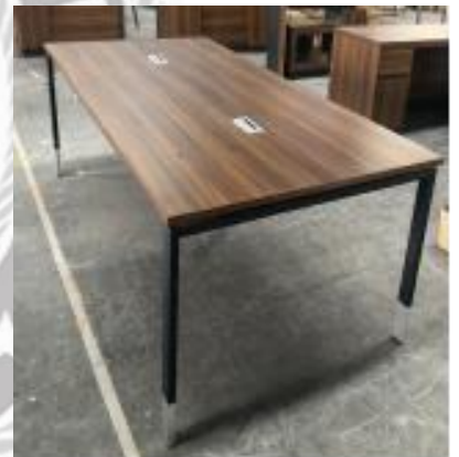
4. CONFERENCE TABLE 2