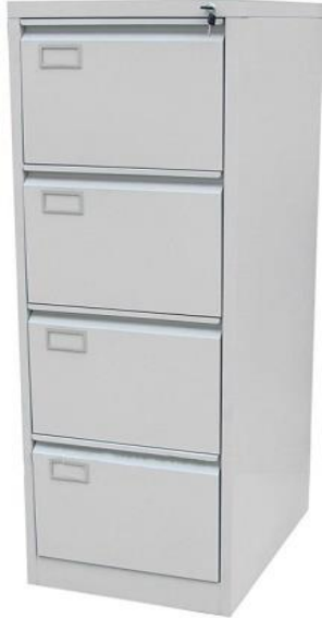
1.4D VERTICAL FILING CABINET