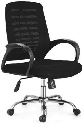
16. SWIVEL CHAIR 1