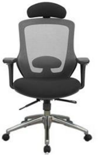
14. SENIOR EXECUTIVE CHAIR