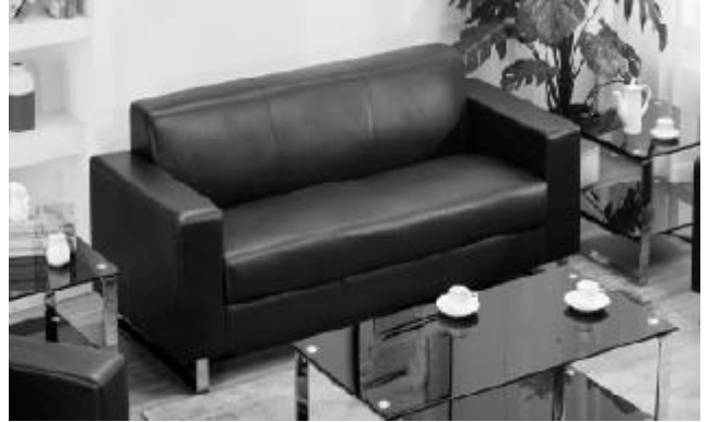
13. SALA SET