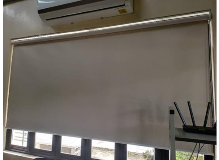
13. SUNSCREEN BLINDS