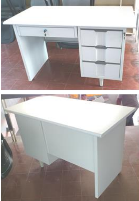
12. CLERICAL TABLE