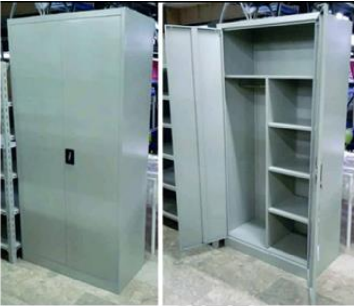
1. WARDROBE STEEL CABINET