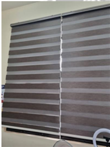
14. 2 TONE COMBO BLINDS