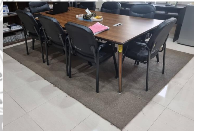
15. FLOOR CARPET