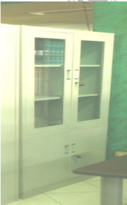
3. HALF GLASS STEEL CABINET