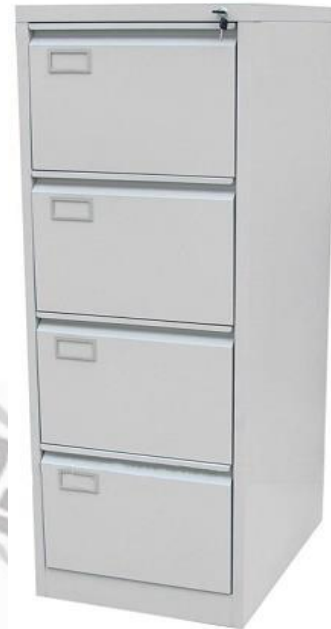
2. FILING CABINET