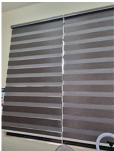
16. 2 TONE COMBO BLINDS