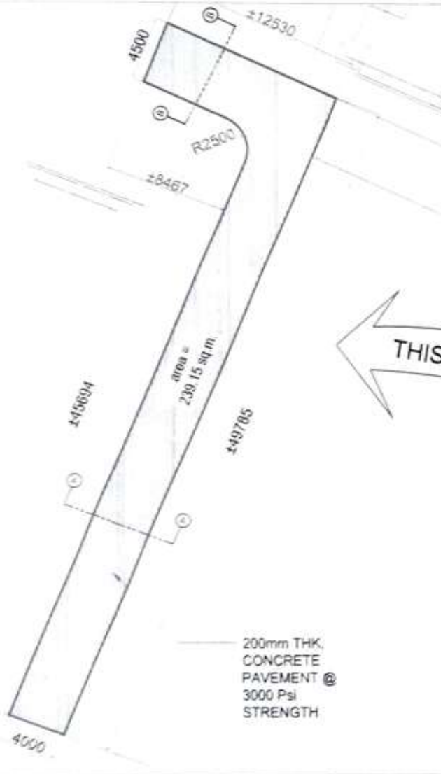
ROAD "A" PLAN SCALE NTS